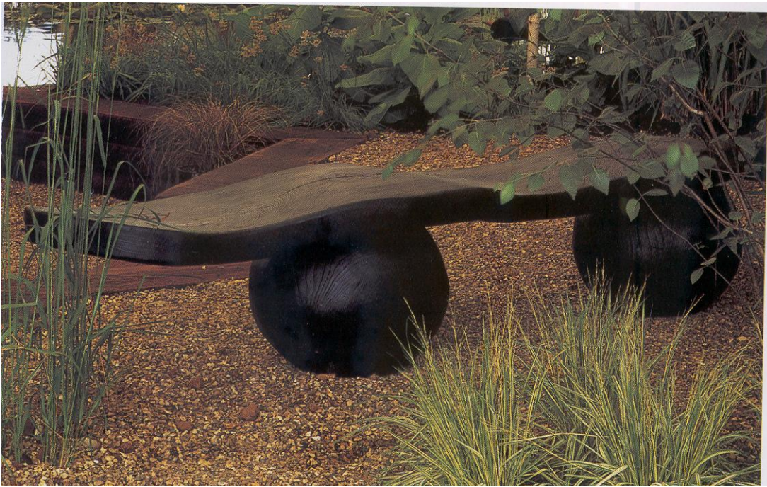
Wooden retaining wall, Wood chips for ground cover, and exotic bench

Some options can include slap benches, natural planters, informal fencing, wildlife snags, wooden stairs, nurse logs, a natural trail system made from wood chips... the possibilities are endless.