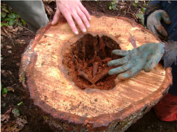
Nurse log stump in preparation to be a planter 2