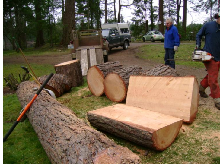
Natural bench under construction 2