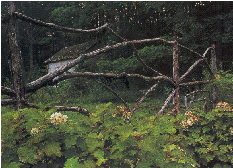
Rustic fence / boundary delineation