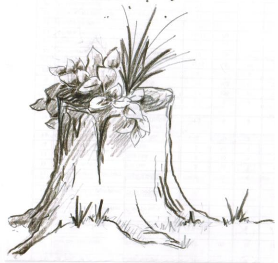
Nurse log stump as a planter 2