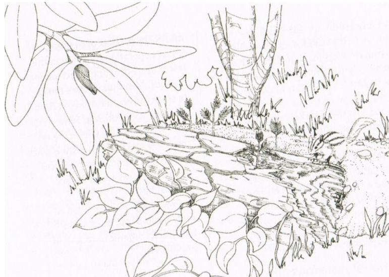
Nurse Log: A biological wonderland in your backyard 1