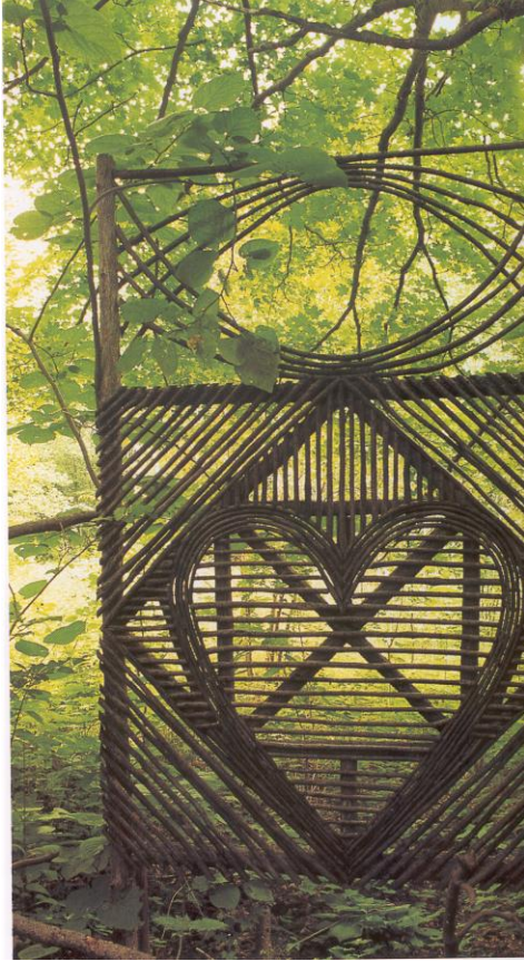
Gate / backdrop braced in trees.